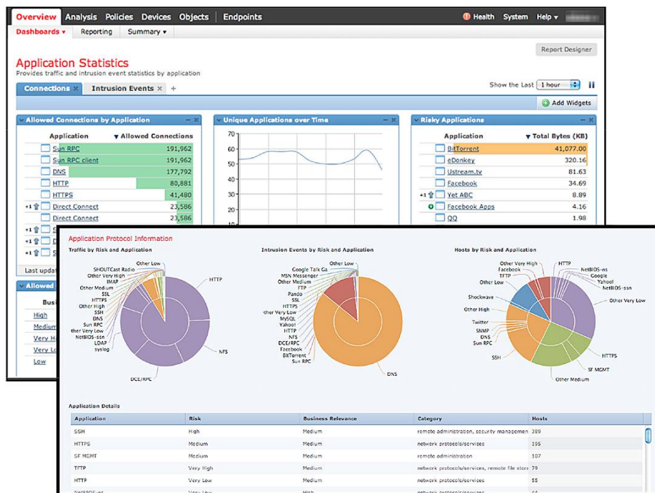
Figure 2. Cisco Firepower Management Center: Intuitive High-Level and Detailed Drill-Down Dashboards