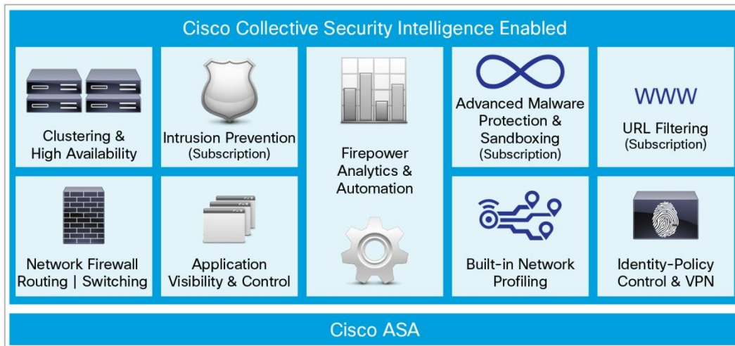
Figure 1. Cisco ASA with FirePOWER Services: Key Security Features